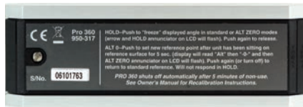
950-317 Back View