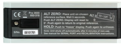
950-318 Back View